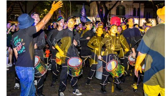
Percussion group Samba Masala at SMU Arts Fest 2023.

Themed POST, the festival delved into the complexities of post-modernity and aimed to evoke conversations about the past, present and future.