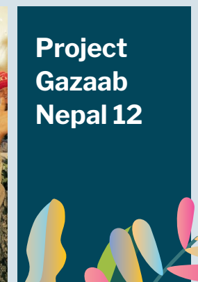
During the 12 th cycle of Project Gazaab Nepal, volunteers journeyed to Nepal's mountains to engage with remote communities and impart business skills to local students.