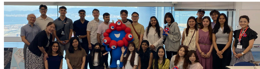
Participants in the SMU-X Overseas course in Osaka, Japan.

It was held in Osaka, Japan. Renowned as the site for the upcoming World Expo 2025 and Japan's inaugural casino resort (by 2030), the second-largest city in Japan presented a captivating backdrop for students to study global innovation dynamics.