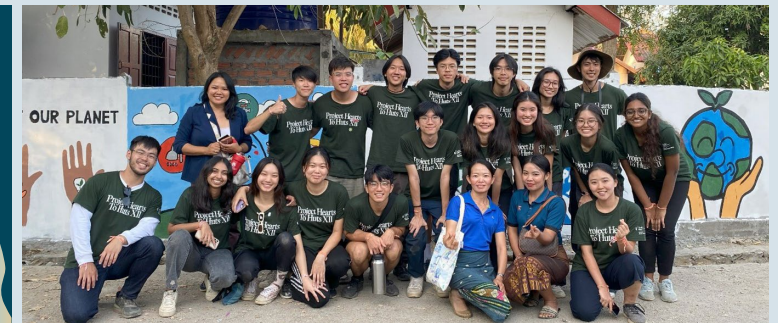
Project Hearts to Huts involves a partnership between YMCA Singapore and Laos. Volunteers travelled to Laos to engage with students from Paksueang Primary School on sustainability efforts, including practical landscaping activities and establishing a compost system for their school.