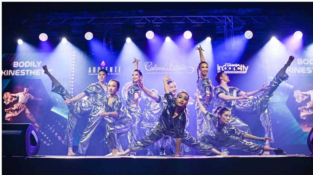
SMU Wushu, SMU Taekwondo, SMU Ardiente, SMU Indancity and SMU Caderas Latinas performing at SMU's Academic Year Opening event in 2023.