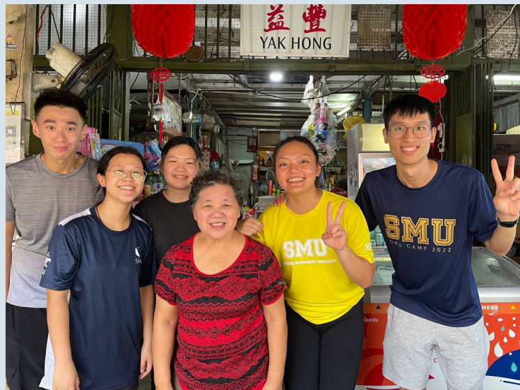
Project Ubin Kakis promotes awareness of Pulau Ubin's cultural heritage, seeking close ties with its communities and exposing more Singaporeans to the island's traditions and village lifestyle. In 2023, its eight project members frequently visited the island to befriend the residents and immerse themselves in the area's rich heritage, participating in events like the Tua Pek Kong Festival and assisting with Chinese New Year preparations.