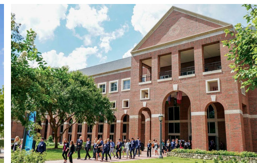
University of North Carolina at Chapel Hill