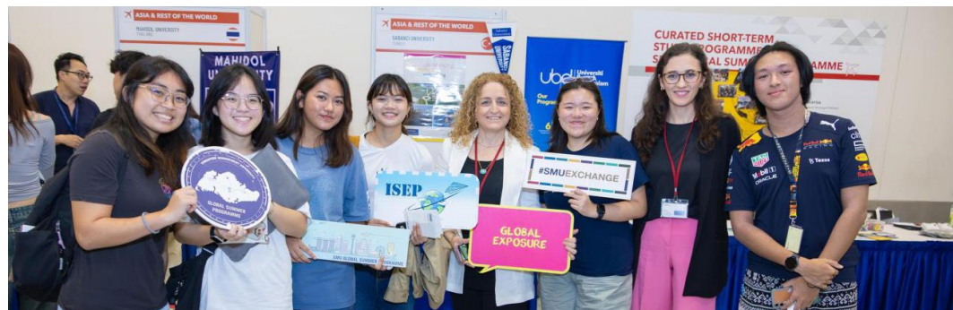
SMU students with representatives from Sabanci University of Turkey at SMU's Study Abroad Fair 2024.