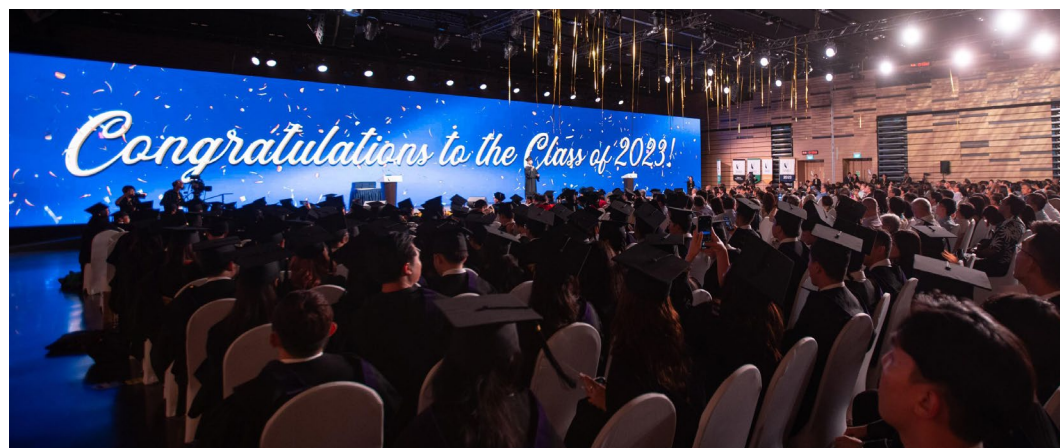
Graduates of the Class of 2023 at the Commencement Opening Ceremony.

Despite a challenging economic landscape in 2023, the Joint Autonomous Universities Graduate Employment Survey showed continued high demand for SMU's 2023 graduates, who registered healthy and stable overall employment.