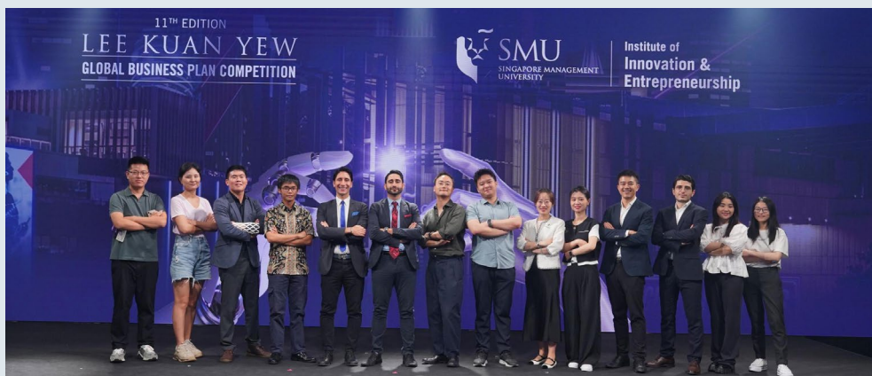
Student founders of the eight grand finalists of the 11th Lee Kuan Yew Global Business Plan Competition.

SMU unveiled the winners of the 11 th Lee Kuan Yew Global Business Plan Competition, organised by the Institute of Innovation and Entrepreneurship. MEDEA Biopharma from the Technical University of Munich and PlasticFri from Karlsruhe