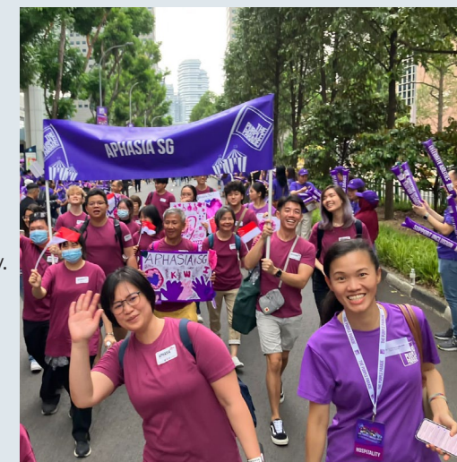
SMU student volunteers and beneficiaries from Project Espresso (a community service project initiated by SMU SoundFoundry in partnership with Aphasiasg), taking part in The Purple Parade to promote awareness and celebrate abilities of Persons with Disabilities in Singapore.

SMU received the People's Association Community Spirit (PACS) Awards 2024 – Excellence Award in recognition for its outstanding dedication and efforts in fostering a caring and cohesive community. Recognition stems from its significant contributions to various Central Singapore Community Development Council initiatives that aim to promote social inclusion, community engagement, and lifelong learning. Through these initiatives, SMU students and staff have enhanced the lives of individuals across Singapore, especially those from vulnerable and disadvantaged backgrounds.