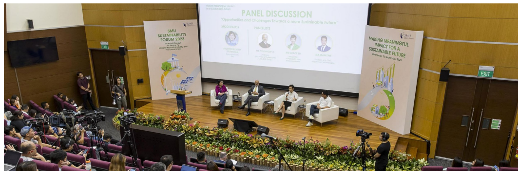
SMU Sustainability Forum 2023

In 2023, the inaugural SMU Sustainability Forum attracted 250 participants, including students, educators, and industry leaders. The event was attended by Minister for Sustainability and the Environment Ms Grace Fu; and included a keynote address