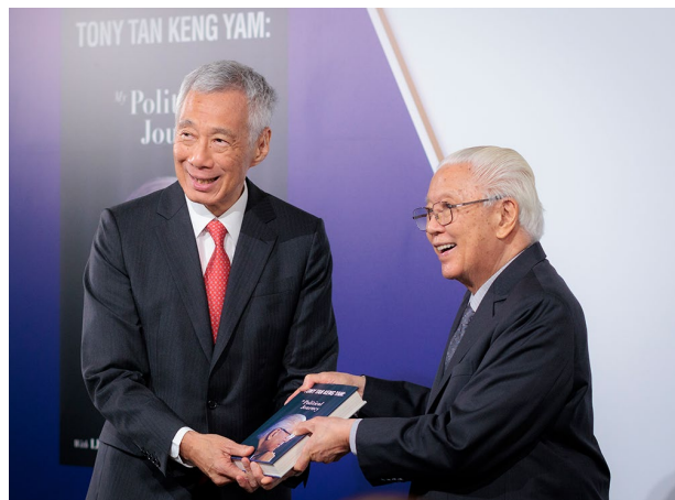
(L-R): Then-Prime Minister Mr Lee Hsien Loong with former President Dr Tony Tan, who is also Honorary Patron and Distinguished Senior Fellow at SMU.

Former President of Singapore Dr Tony Tan Keng Yam unveiled his memoir, Tony Tan Keng Yam: My Political Journey , at SMU in March 2024. The event, officiated by then-Prime Minister of Singapore Mr Lee Hsien Loong, was attended by dignitaries like Emeritus Senior Minister Mr Goh Chok Tong and Senior Minister of Singapore Mr Teo Chee Hean. The book details Dr Tan's contributions as Singapore's seventh President and his role in shaping policies on education, finance, and defence. It offers personal insights into key national decisions and aims to inspire future leaders.