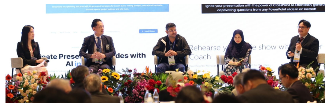
Panellists at the 4 th AUN-TEPL Symposium organised by SMU in Bangkok.

Senior leaders and educators from the ASEAN University Network (AUN) gathered in Bangkok for the 4 th AUN-TEPL [Technology-enhanced Personalised Learning] Symposium on 28 May 2024. Organised by SMU in collaboration with other universities in the region, the event focused on “AI for Personalised Learning”.