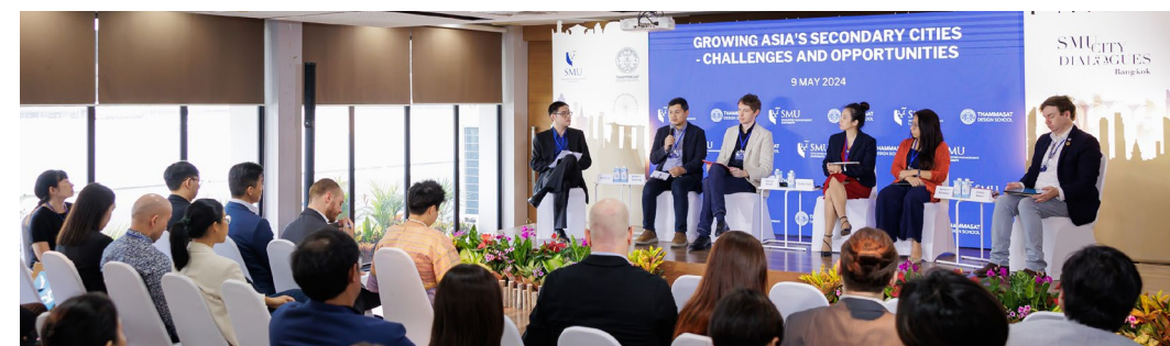
SMU City Dialogues Bangkok 2024.

SMU launched the inaugural overseas edition of City Dialogues in Bangkok on 9 May 2024. Held in partnership with Thammasat University, the event focused on the theme “Growing Asia's Secondary Cities – Challenges & Opportunities”. The forum gathered leaders from various sectors to discuss sustainable urban development.